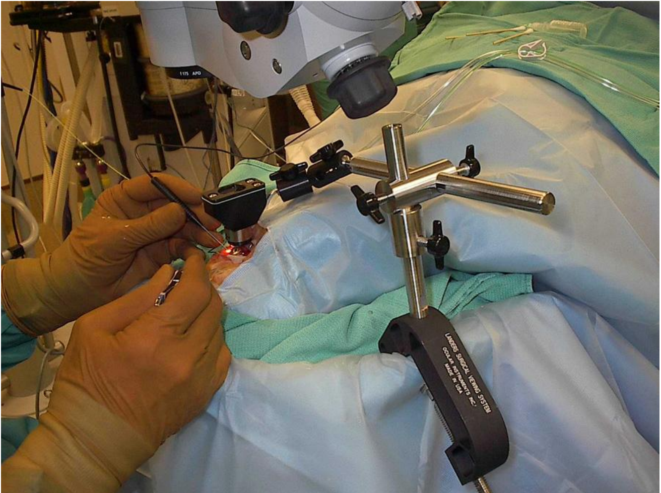
Illustration of OSVS-U132-2 In Use

The illustration above shows the OSVS attached to a wrist rest with the vertical shaft attached at the shoulder (Hole A) of the clamp. The surgical procedure is being performed using the Ocular Peyman-Wessels-Landers 132 Diopter Upright Vitrectomy Lens.